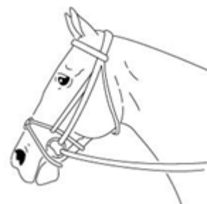
Correctly fitted Cross Noseband