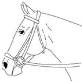
Correctly fitted Drop Noseband